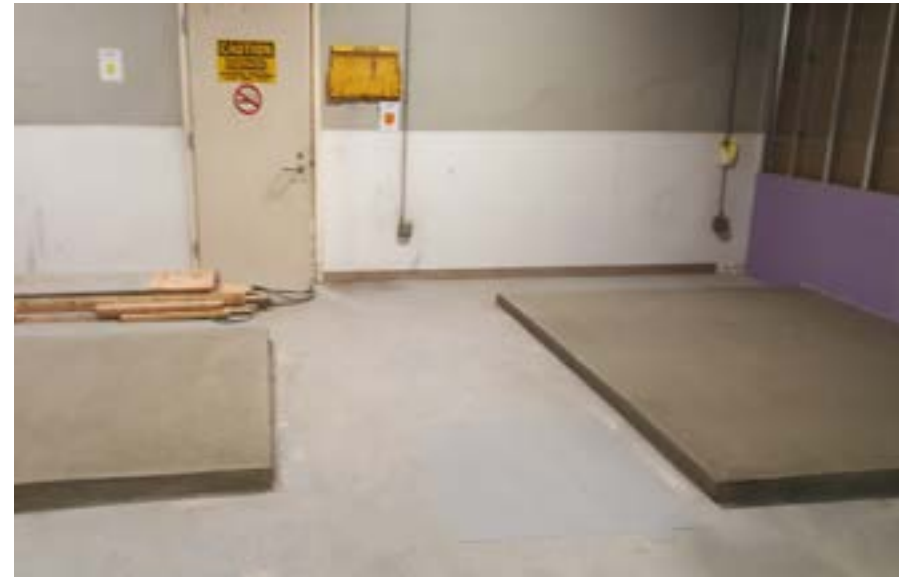
Stellar retrofitted this small existing space to accommodate a boiler addition including water treatment system. We updated the ventilation system to adhere to code compliance and added the equipment pads. Additional skid-mounted equipment was configured for installation in this same space. The new equipment provided support to the existing facility mechanical systems with seamless integration and virtually no loss to plant production output.